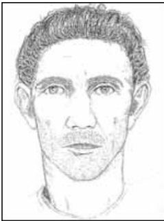
The individual in this police sketch may have been a witness to the crime or may have other information about the murder.